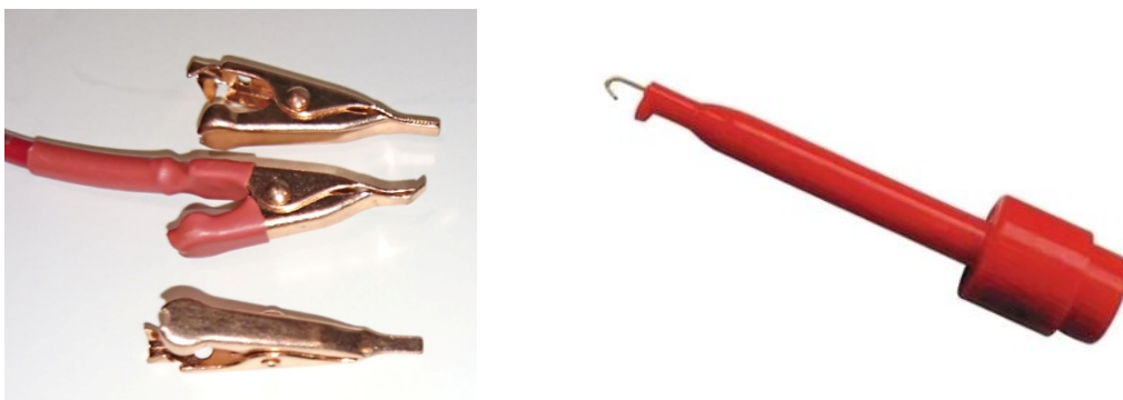
Figure 7: loading coil clip or “grabber” style test clip

The clips for the coil wander leads were formed by bending the tips of the “micro clip” inward slightly so it securely grabs one of the coil turns and doesn’t slip off (Figure 7). “Grabber” hook type test lead clips could also be used. I used a piece of 18 gauge stranded wire about 8 inches long with a terminal lug that fit over the 3/8 inch threaded rod.