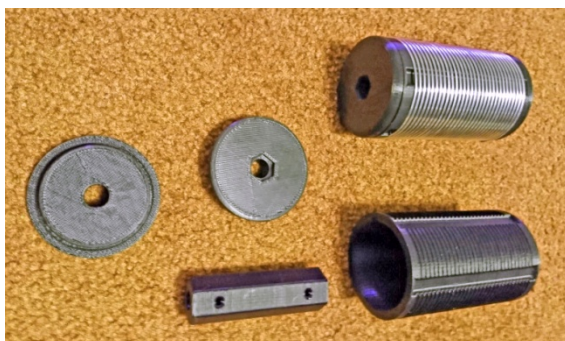
Figure 2: coil form parts and one with wire installed

Andy also designed and printed a centre T-hub with a standard “painters pole” thread mount to support the two coils and whips (Figure 3).