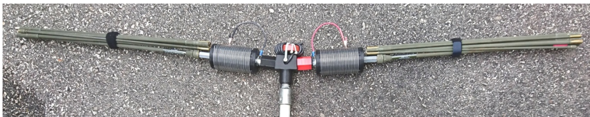
Figure 1: The WAXTENNA-PRD antenna

The Wireless Amateur Experimenter Group (WAX Group) is a special interest group within the Barrie Amateur Radio Club. This is a “builders group” for those interested in making and designing things for their ham radio hobby. Visit us at https://barriearc.com/builders-group .