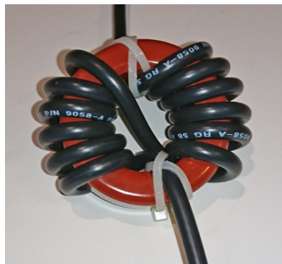
Figure 4: Choke balun

We also decided that using a common-mode choke balun would be a good idea, so that was also added to the project (Figure 4). We used a T200-2 toroid (FT types in a 43 mix would be better) wound with 12 to 14 turns of RG58 coax – one end of the coax connects to the coil mounting bolts inside the centre-T adapter and the other end can have a BNC or UHF style connector to add additional coax to reach your rig.