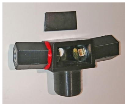
Figure 3: Centre T-adapter